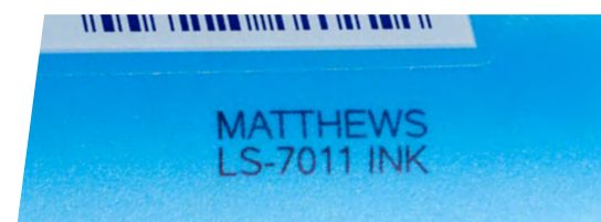
L1 mark on shampoo bottle