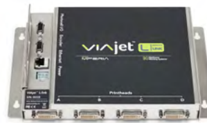
L-Link Control Module