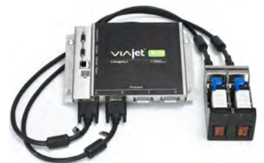
L-Link and Interlaced L1 Printheads