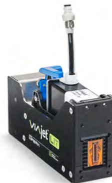
L1 Bulk Cartridge Printhead