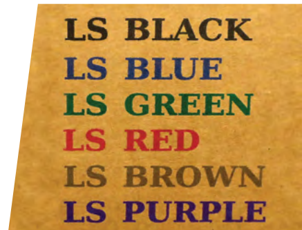
L1 marks on kraft brown corrugate