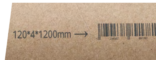
L1 mark on cardboard roll